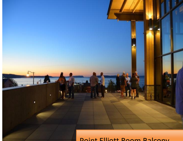
Point Elliott Room Balcony