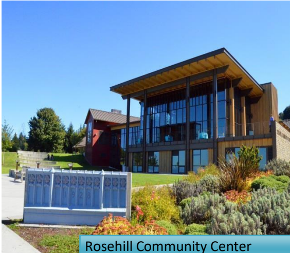
Rosehill Community Center